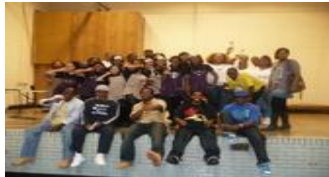
The 11th Annual Bazzwork Talent Show

You can find more information about the Bazzwork Talent Show as well as other events from Shabazz at www.bazzwork