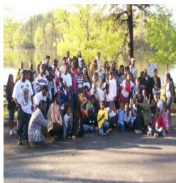
Family Day '08 a time for fun, recreation and relaxation